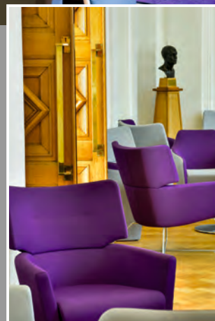
Civic Foyer space offered for extra flexibility