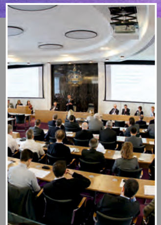
Council Chamber in use