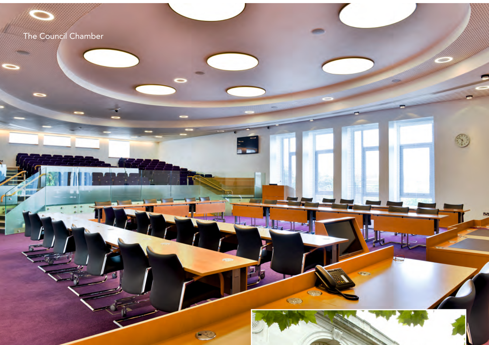
The Council Chamber

The delegate rates listed overleaf are a guide and charges may vary. Other rates are available: please contact us for more information and to discuss your requirements.