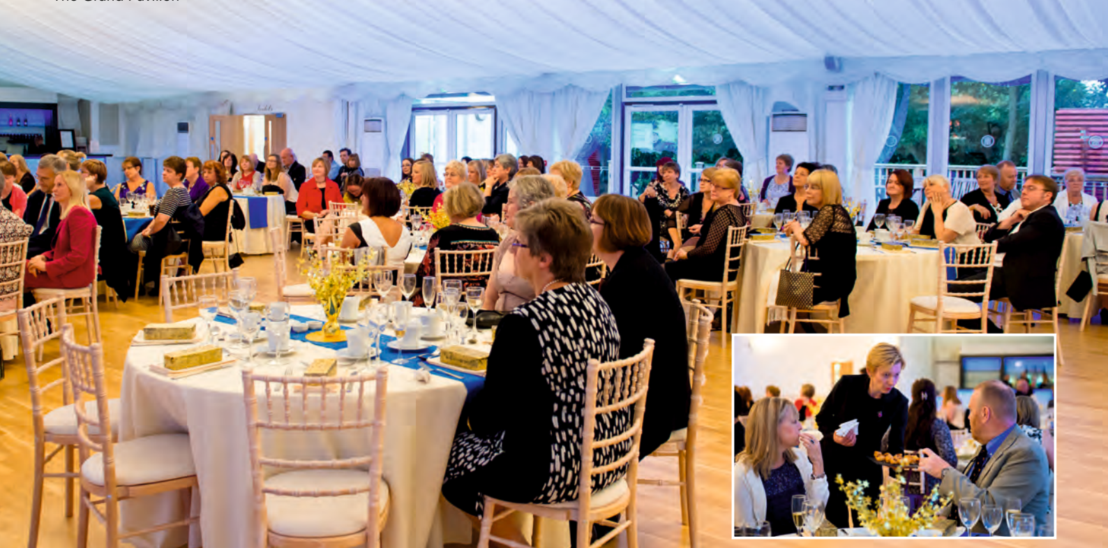
The Grand Pavilion