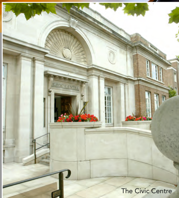
The Civic Centre

The delegate rates listed overleaf are a guide and charges may vary. Other rates are available: please contact us for more information and to discuss your requirements.